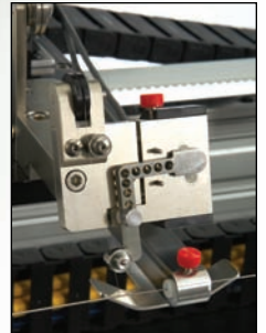
winding compensation for consistent pitch

RGA precision wire winders are available in standard sizes as well as custom sizes to suit your manufacturing needs. All models offer unique features not available from other manufacturers including EasyWind Windows™-based software which allows easy operator set up and control.