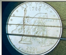
produce surgical-quality coils