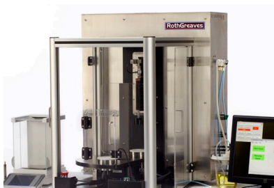
Functional Attributes Test Station